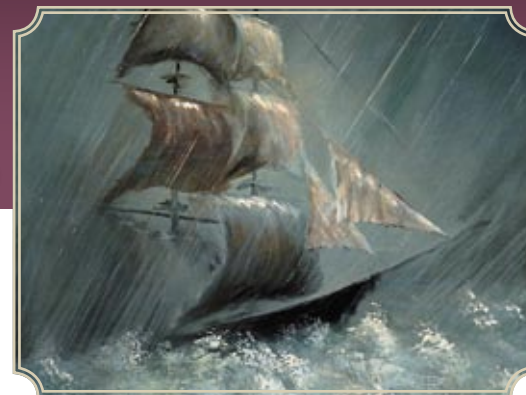
The faith of Moravian fellow-passengers during a storm at sea changed the course of John Wesley's spiritual life.

A notable aspect of John Wesley's preaching was what he called "Christian perfection." Wesley addressed it thoroughly in a book, A Plain Account of Christian Perfection , but despite his efforts, the subject remained poorly understood and contentious his whole life. For him, Christian perfection meant complete surrender to God, and living wholly each day for God. It meant freedom from habitual sin and growth in character. It did not mean a Christian would do everything perfectly, not make mistakes, or not face hard temptations. It did not mean one could never sin again, or that one had